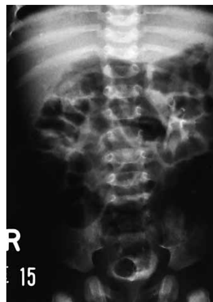
Fig. 2. Excretory urography shows poor visualization of the right kidney and a filling defect in the bladder.

Klinefelter's syndrome with anomalies of the urinary tract is extremely rare. Egli and Stalder [10] reported only one renal anomaly (cystic kidney) in 276 cases of 47,XXY syndrome, and no renal anomalies in 7 cases of 48,XXXXY